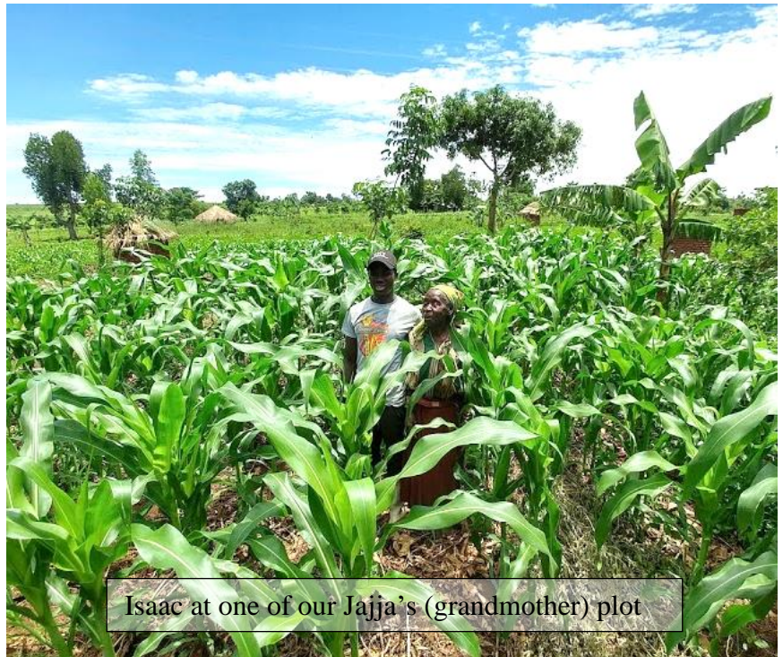
Isaac at one of our Jajja's (grandmother) plot

The last few months have been jam-packed full of activity with national training events that I (Chris) plan. In May we had a compost making class hosted at Amazima which was very successful. Compost is such a key part in