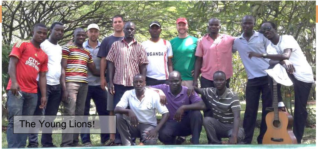
The Young Lions!

One of the keys to getting the Good News of the Kingdom out in Uganda is having more young Ugandans who are excited about sharing Farming God's Way with rural communities all over the country. We have many young men and women excited about teaching Farming God's but they get little mentoring in their local churches due to the focus on