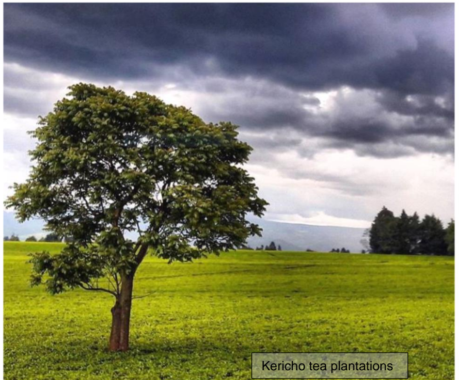
Kericho tea plantations