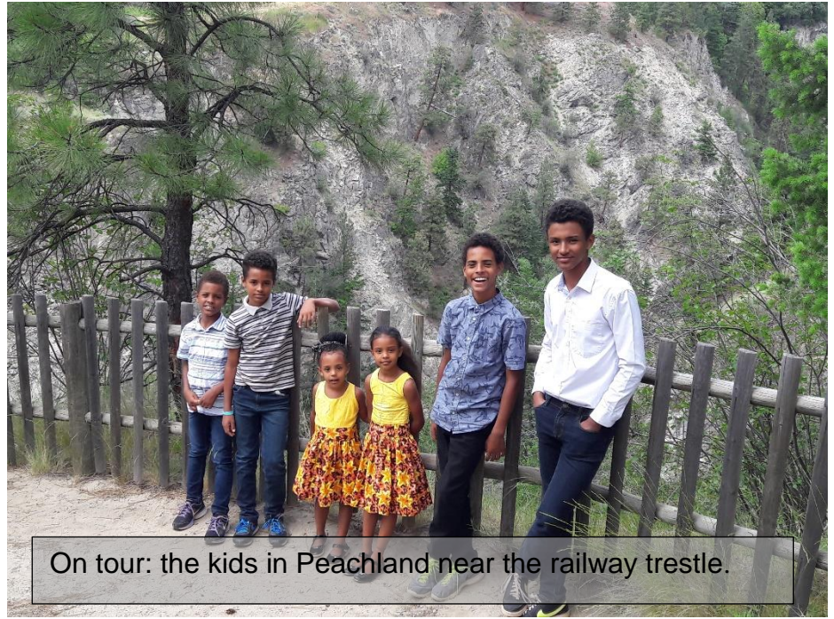
On tour: the kids in Peachland near the railway trestle.

The last reason (that I'll mention here) that we come to Canada is to widen our financial support base. Our family needs continue to grow with larger teenage appetites and increased costs of educating them. Living costs and airfares continue to climb. In addition, our work continues to grow with a larger scope and more influence both in Uganda and in Africa at large. Unlike most people a missionary can't put in overtime to meet some extra needs or pay for unexpected bills. We rely on the generosity of others to live and work! So, we spend a lot of our time trying to connect with new people so as to widen our support family. Team building is an essential part to our Home Assignment.