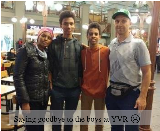
Saying goodbye to the boys at YVR ☹️