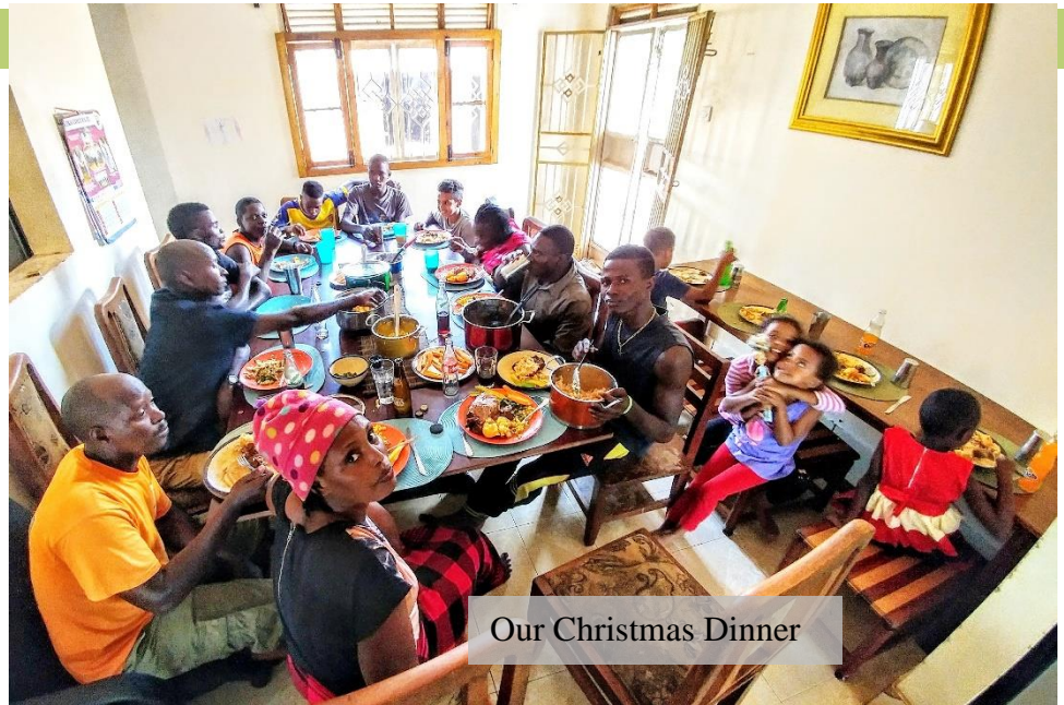
Our Christmas Dinner