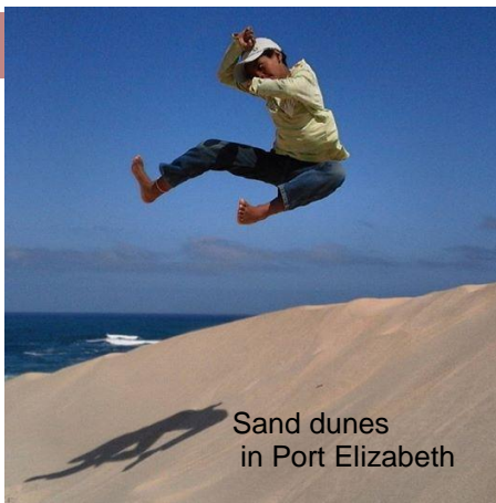
Sand dunes in Port Elizabeth