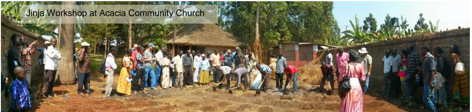
Jinja Workshop at Acacia Community Church

We are just into March and the New Year has already brought a lot of activity and a lot of change! We hope you've had a good start to the New Year as well. On January 7-9 th we hosted a Farming God's Way (FGW) training here in Jinja, our home town, to over 80 people. We had farmers, leaders and directors of NGO's, an army commander's wife and leaders from Acacia Community church which is our home church here (where the workshop was also hosted). We had a great time challenging these people to be faithful with what God has given them and to devote their gardens and their lives to God's glory. We have a really great garden there in the corner of the church yard where church members are able to observe the progress of the garden each week. We've even had a weeding session after one church service!