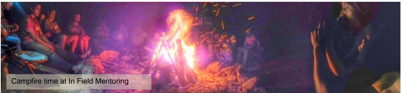
Campfire time at In Field Mentoring

The Second main event of the year that we hosted was In Field Mentoring. This was the first time that Uganda has hosted this event and it went quite well, despite a few difficulties. In Field Mentoring is a week long event where FGW trainers and advocates gather together in a camp setting to buildup their skills and to reach out to surrounding communities with a four day FGW outreach workshop. We camped at the Nile River Campground with amazing views of the Nile during mealtimes. During the week we assessed and built up our trainer base through observing trainers while they teach and train the poor rural farmers. Most evenings ended with a campfire meeting where we went over the day's events and encouraged and challenged the trainers in their training methods and their heart for the poor. We were really happy to also accredit Bill Stough, who serves with AIM, at the end of the week. He is now our 5 th accredited trainer from Uganda!